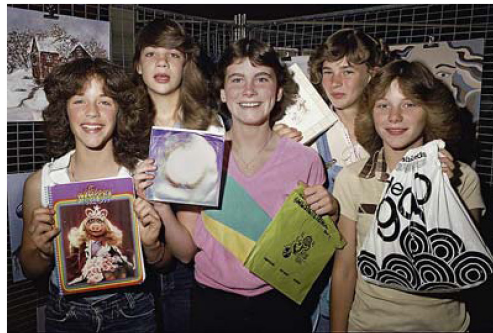
Joel Sternfeld, New Jersey, (#17), May/June 1980

In the main gallery at Luhring Augustine, there's a photograph of a dark-haired woman lying in the grass. With her back to the viewer, she gazes into the distance at a building. Though the picture was taken in 1980, and the building bears a "SEARS" logo, the photograph more than closely resembles Andrew Wyeth's painting Christina's World (1948)—Wyeth's most famous work—of a young woman lying in a field looking up at a farmhouse and barn. The image, New Jersey (#3) by Joel Sternfeld, is in a section of the gallery titled "At the Mall, New Jersey." The photos around it are portraits of shoppers holding items they've purchased (a Miss Piggy notebook, a 45, toy makeup, a cannoli) and wearing youthful smiles or looks bordering on exhaustion.