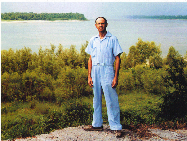
Joel Sternfeld. A man on the banks of the Mississippi, Baton Rouge, Louisiana, August 1985, from Stranger Passing.

He began by associating himself with the New Topographics movement, a group of photographers who, following Walker Evans before them, aimed to minimise all trace of authorial inflection in their work. Its leading exponents included Robert Adams and Lewis Baltz, and like them Sternfeld started using a large-format 10x8in plate camera as his tool of choice. The strongly conceptual,