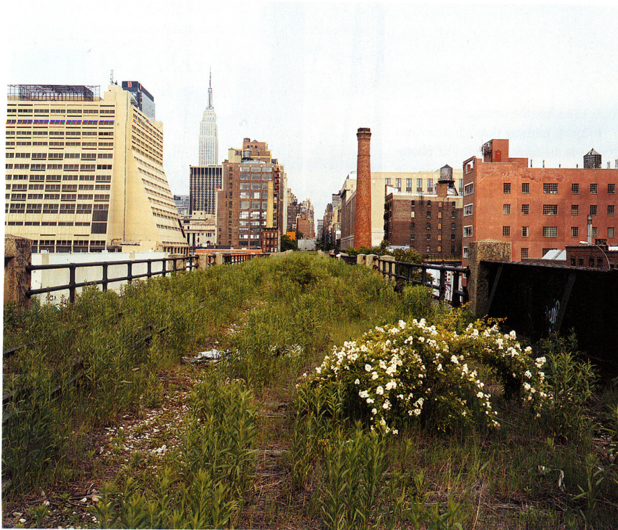
Joel Sternfeld, Looking east on 29th street on a morning in May, 2000. © Joel Sternfeld. Courtesy Pace/MacGill Gallery, New York